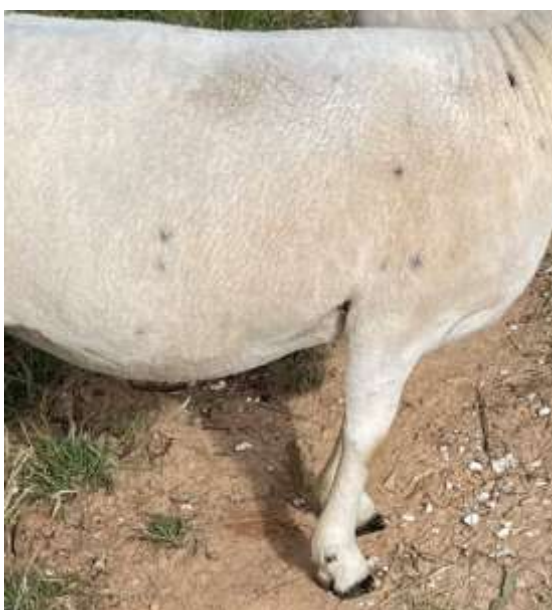
3-year-old ewe with some ticking

Wiltipoll skin is pink and ticking may become evident as animals age. No ticking is preferred.