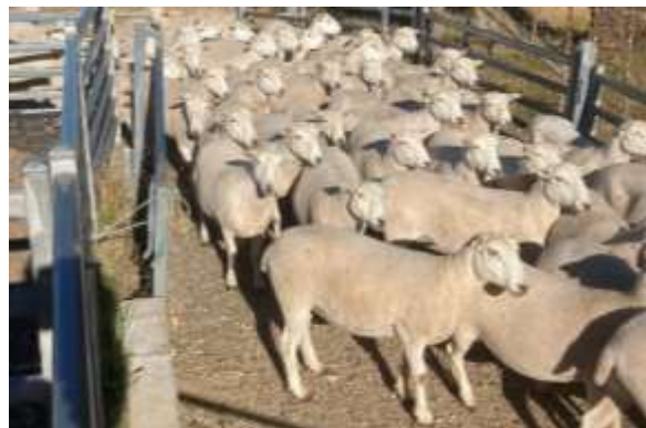
Flock of fully shed ewes