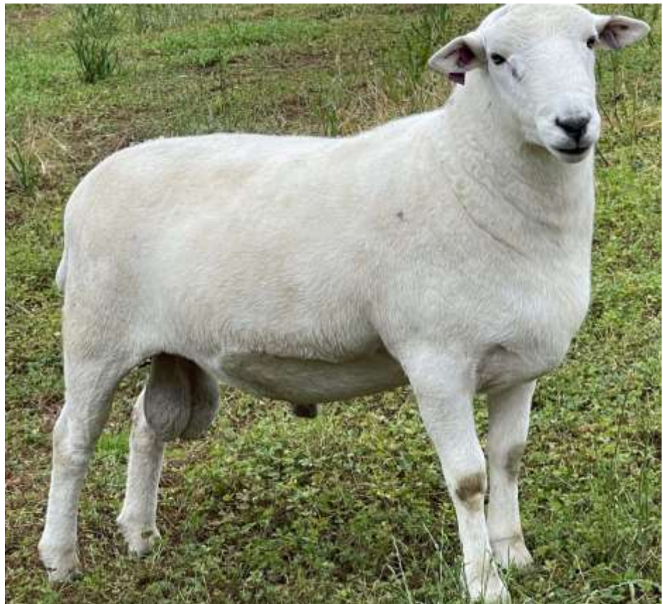
Ram 15 months