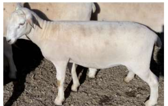
Ram Lamb with straight strong back

Well filled and muscled, strong level back (may be slightly raised to the rear).