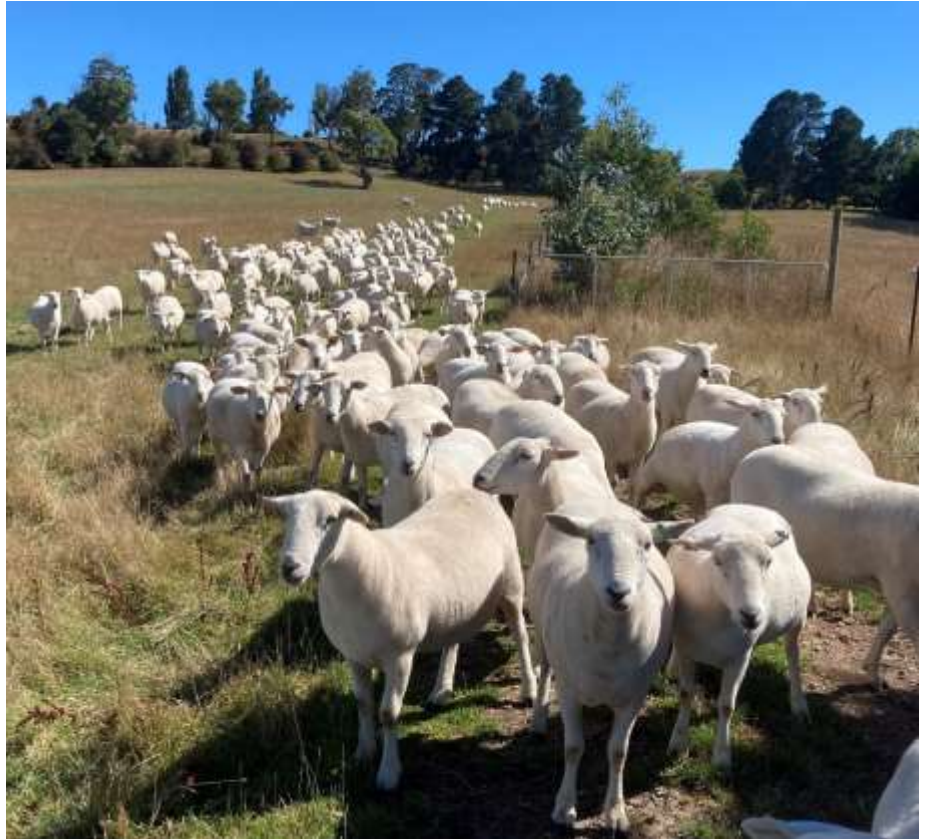
A flock of commercial ewes

Ewes with lambs demonstrate a strong desire to stay with and guide their lambs when mustering.