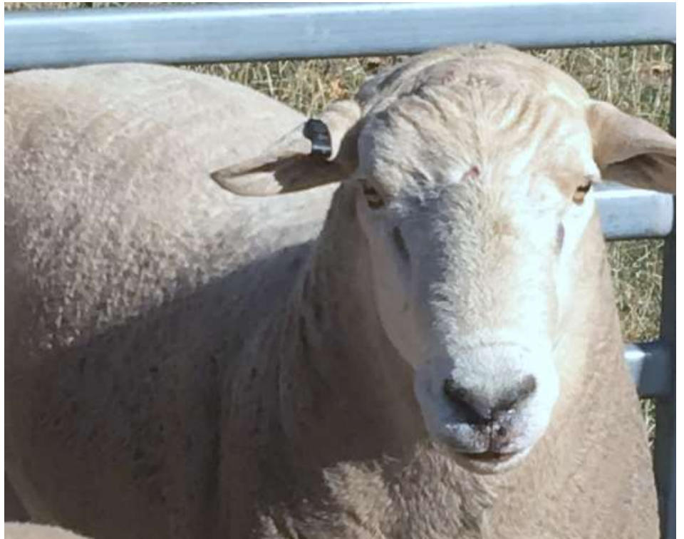
Ram displaying chevron pattern

During breeding season, rams will likely display a chevron pattern of skin wrinkles on the forehead. An experienced ram may lose up to 30% body weight over a 6-week joining.