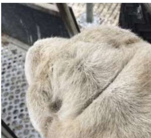
Depression in horn site

Wiltipoll sheep, as the name suggests, are fully polled with a depression in the bone of the skull at the horn site. A Keratin scur or bony knob, no more than 5mm above skull profile, may be evident however no scur is preferred.