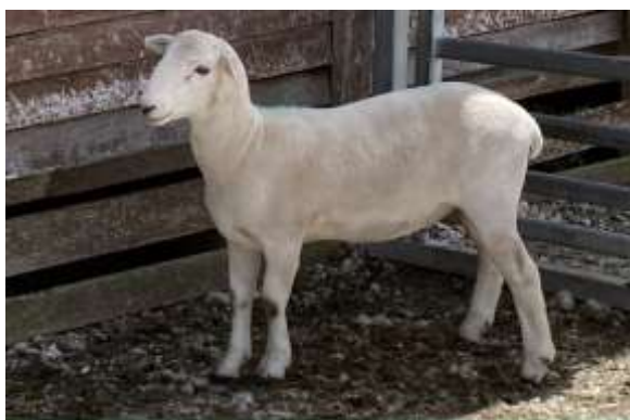
Fully shed lamb

Wiltipolls are an easy-care breed and are fully, clean shedding which means no crutching, no shearing and reduced need for external parasite treatment. Adult (two tooth and over) Wiltipolls must shed their fleece fully from late winter to early summer (timing is influenced by seasonal conditions, nutrition and geographic location). Lambs should be fully shed, by early summer, the year following their birth.