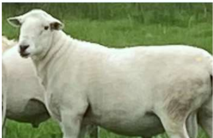
Over 5-year-old ram with no ticking